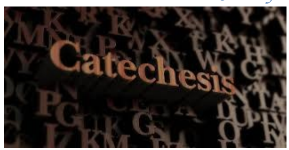
ZOOM CATECHESIS SUNDAYS 8.00PM - 9.00pm

From the Parish Priest's Desk...Our Lenten Journey.