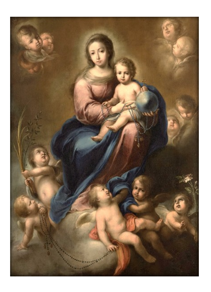
Our Lady of the Rosary In the end my Immaculate Heart will triumph! Fiat!