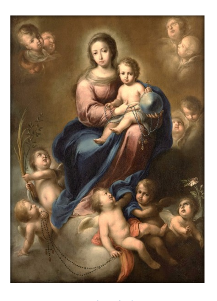
Our Lady of the Rosary In the end my Immaculate Heart will triumph! Fiat!