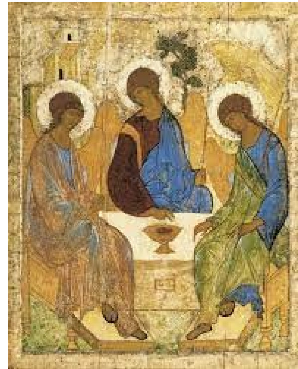
Andrei Rublev The Trinity The greatest Russian icon.