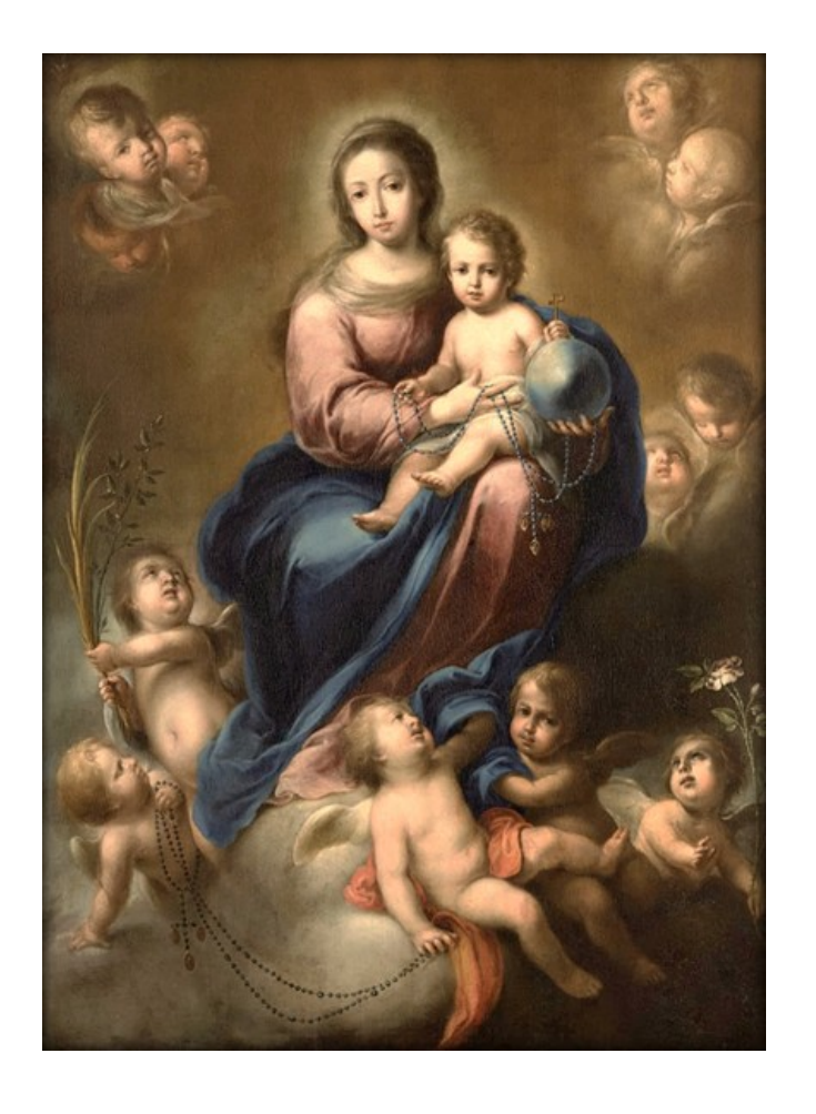
Our Lady of the Rosary In the end my Immaculate Heart will triumph! Fiat!